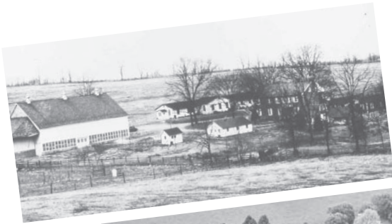
Left: Brook Lane Farm 1949