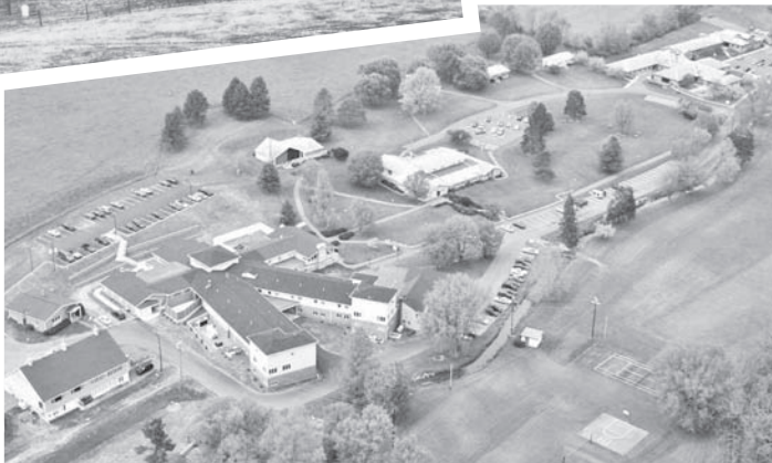
Right: Brook Lane Campus 2009