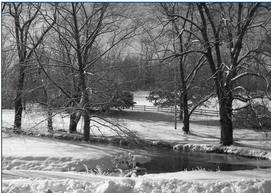
Our brook with new fallen snow

IN THIS ISSUE ————— Employees of Recognition; Page 4