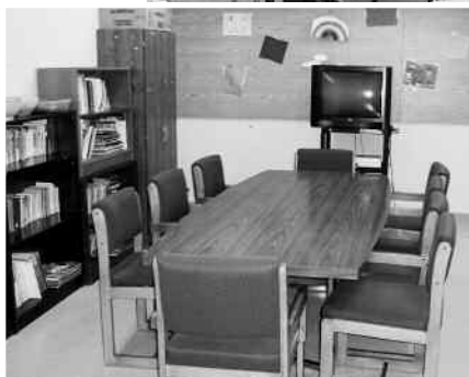
Above and at Left: The new Partial Hospitalization Program Classroom and Group Room.