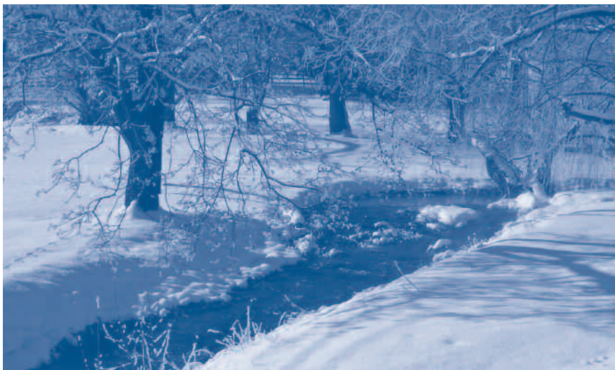
The brook on Brook Lane's Campus after a snow this winter.